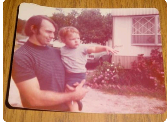
Big Skip & Little Skip