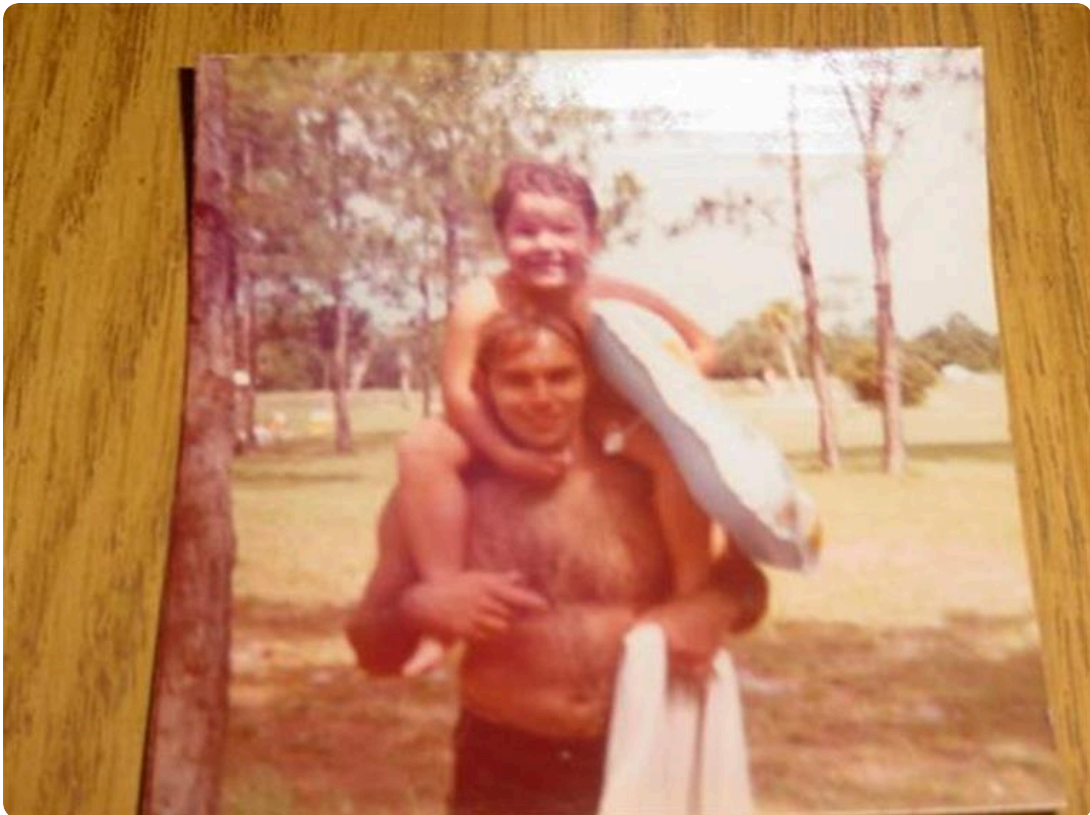
Skip & Skipper at Oscar Sher State Park